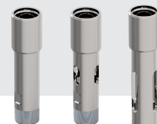
Standard tag bar Slotted tag bar